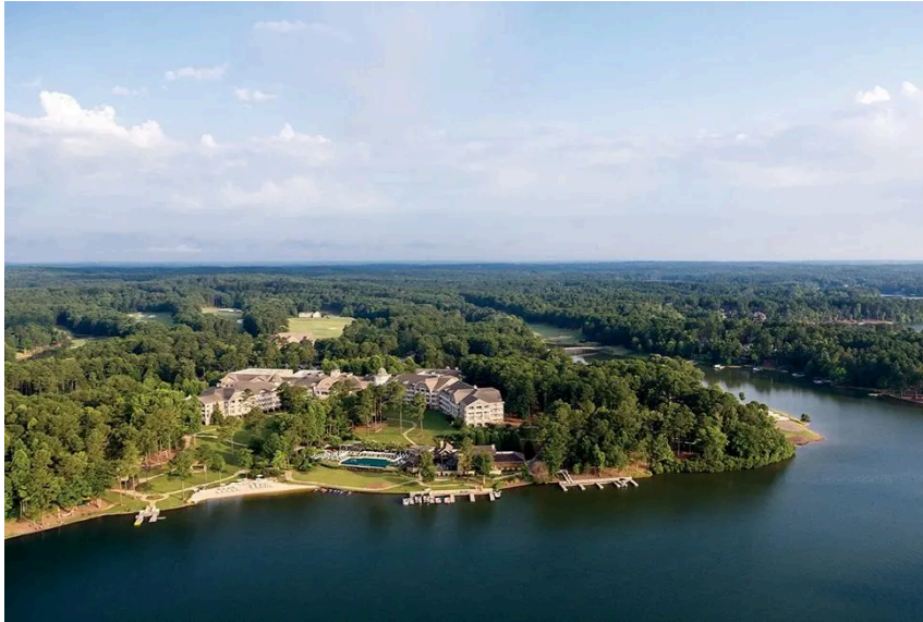
Feel like a member of the Reynolds Golf Club. THE RITZ-CARLTON REYNOLDS, LAKE OCONEE