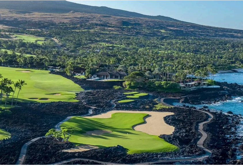
Hualalai Golf Course welcomes Four Seasons guests.