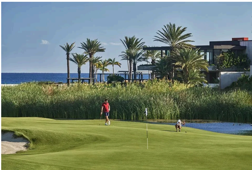
Your Four Seasons stay grants you Costa Palmas Golf Club play.