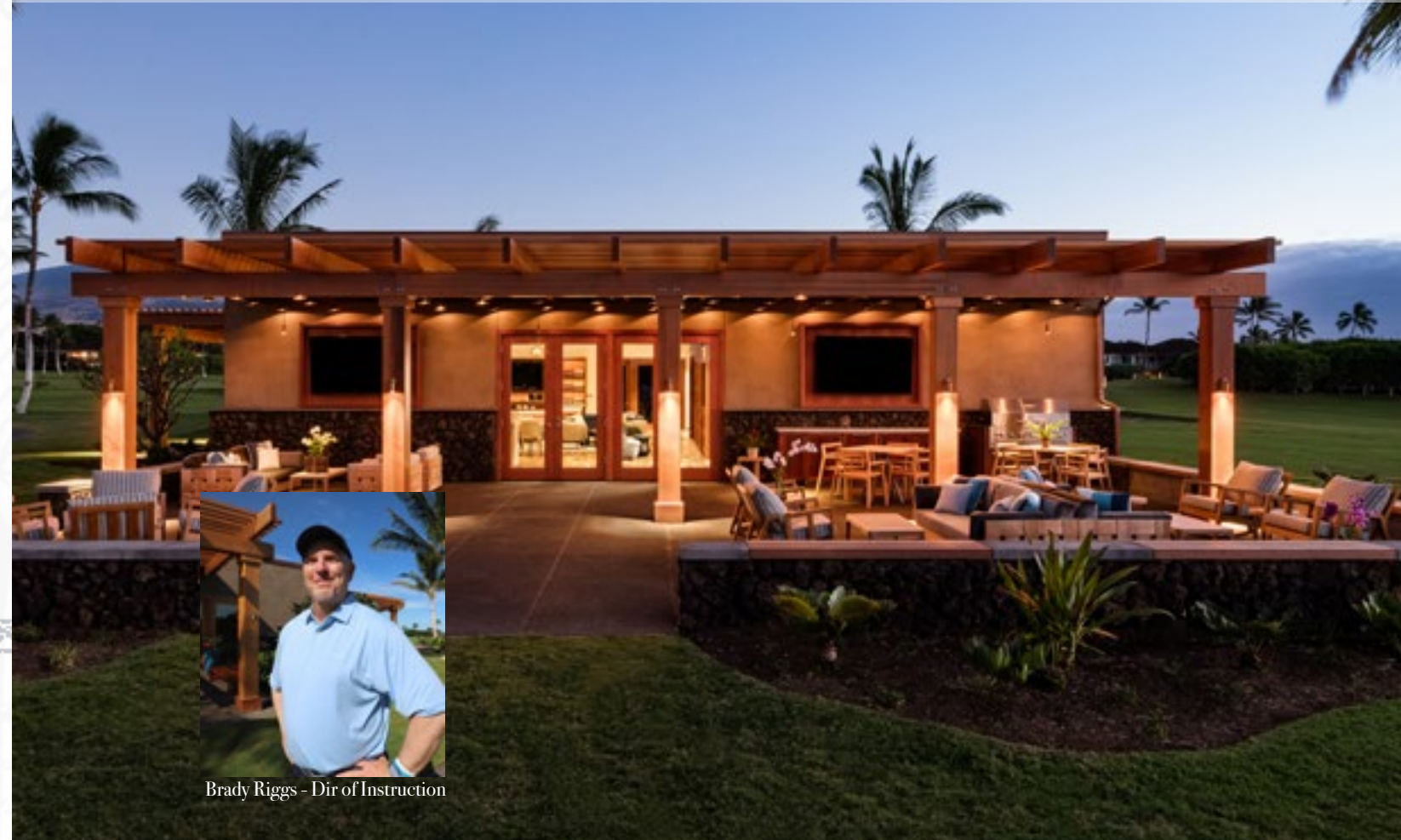
Brady Riggs - Dir of Instruction