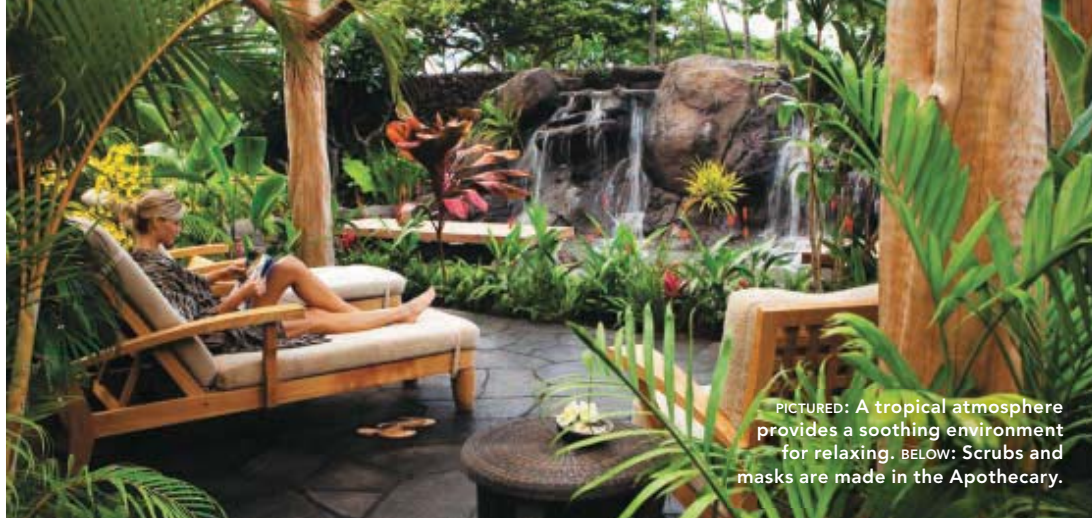
PICTURED: A tropical atmosphere provides a soothing environment for relaxing. BELOW: Scrubs and masks are made in the Apothecary.