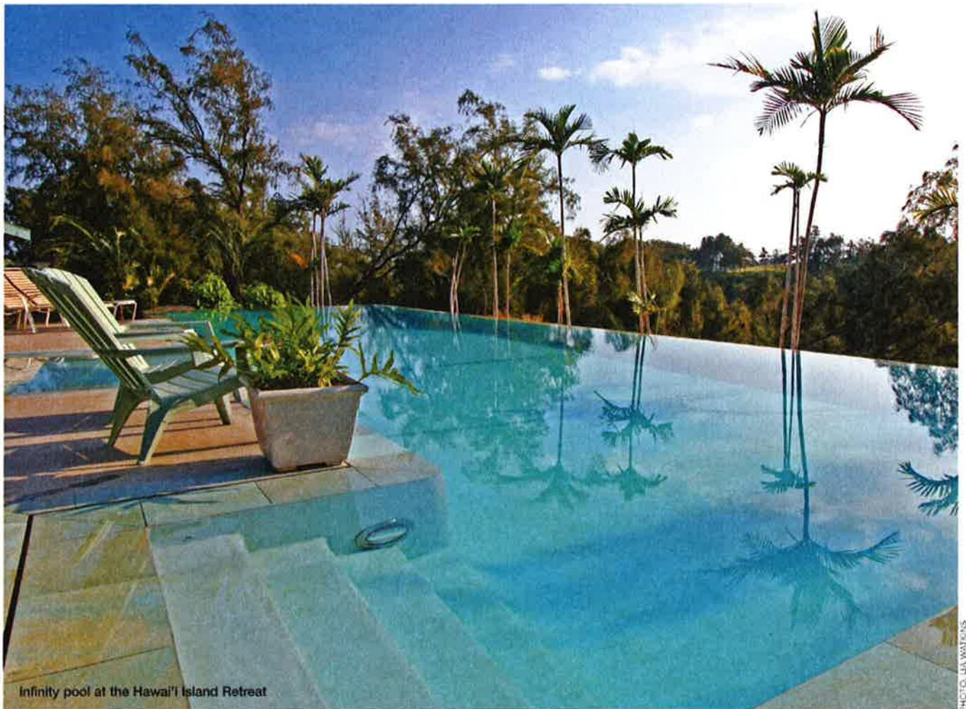
Infinity pool at the Hawai'i Island Retreat

• For more information, visit http://gohawaii.com/big-island ■